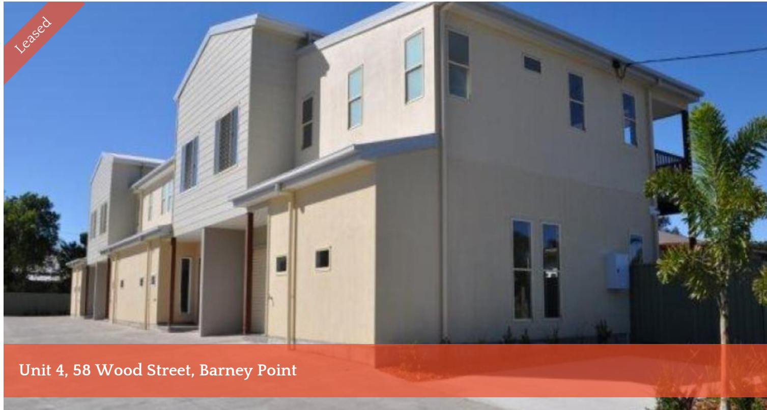
Unit 4, 58 Wood Street, Barney Point