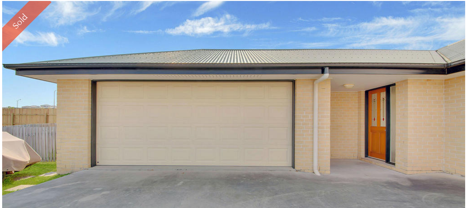
Unit 2, 12 Bridgeman Pl, New Auckland