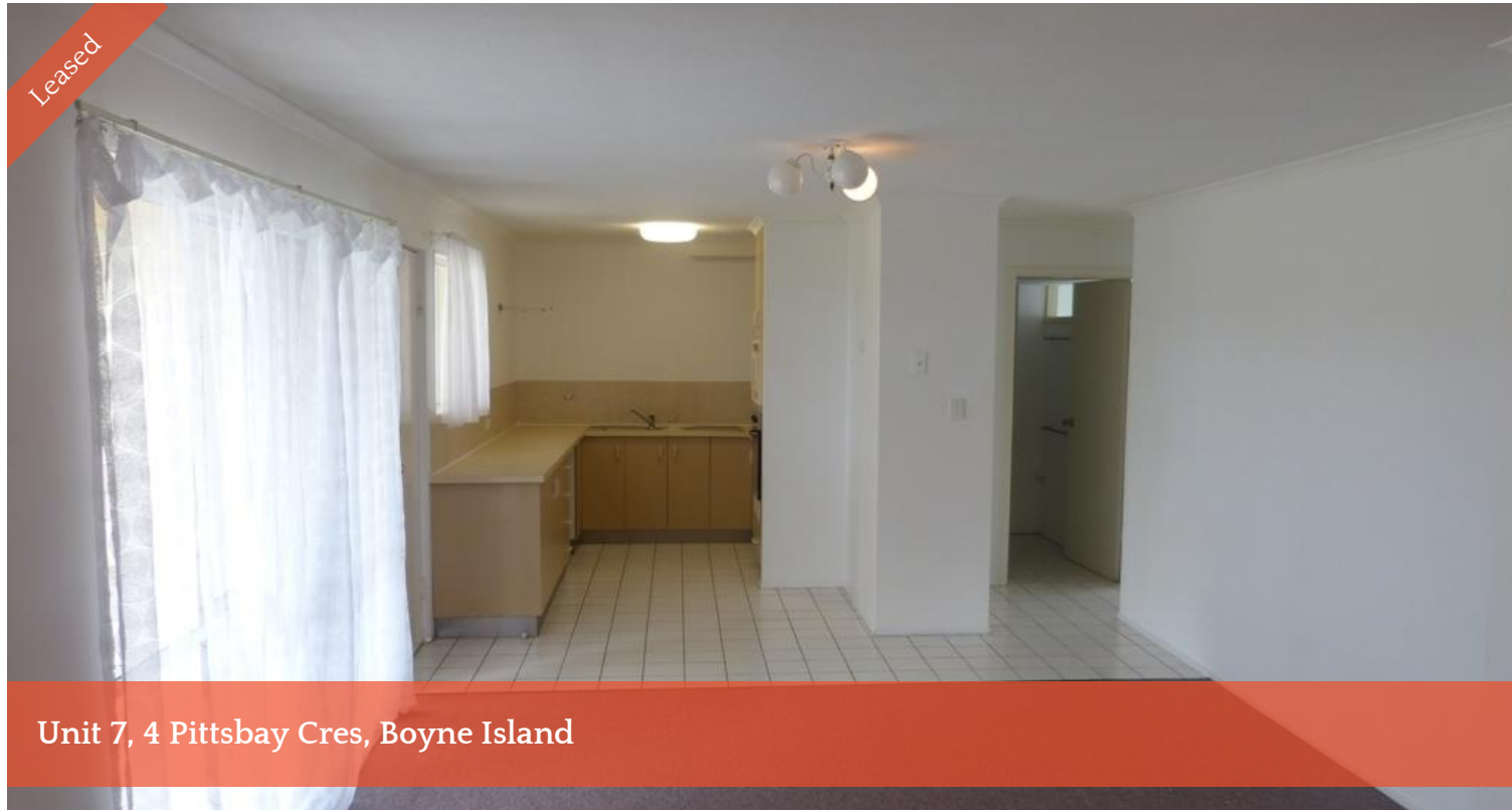
Unit 7, 4 Pittsbay Cres, Boyne Island