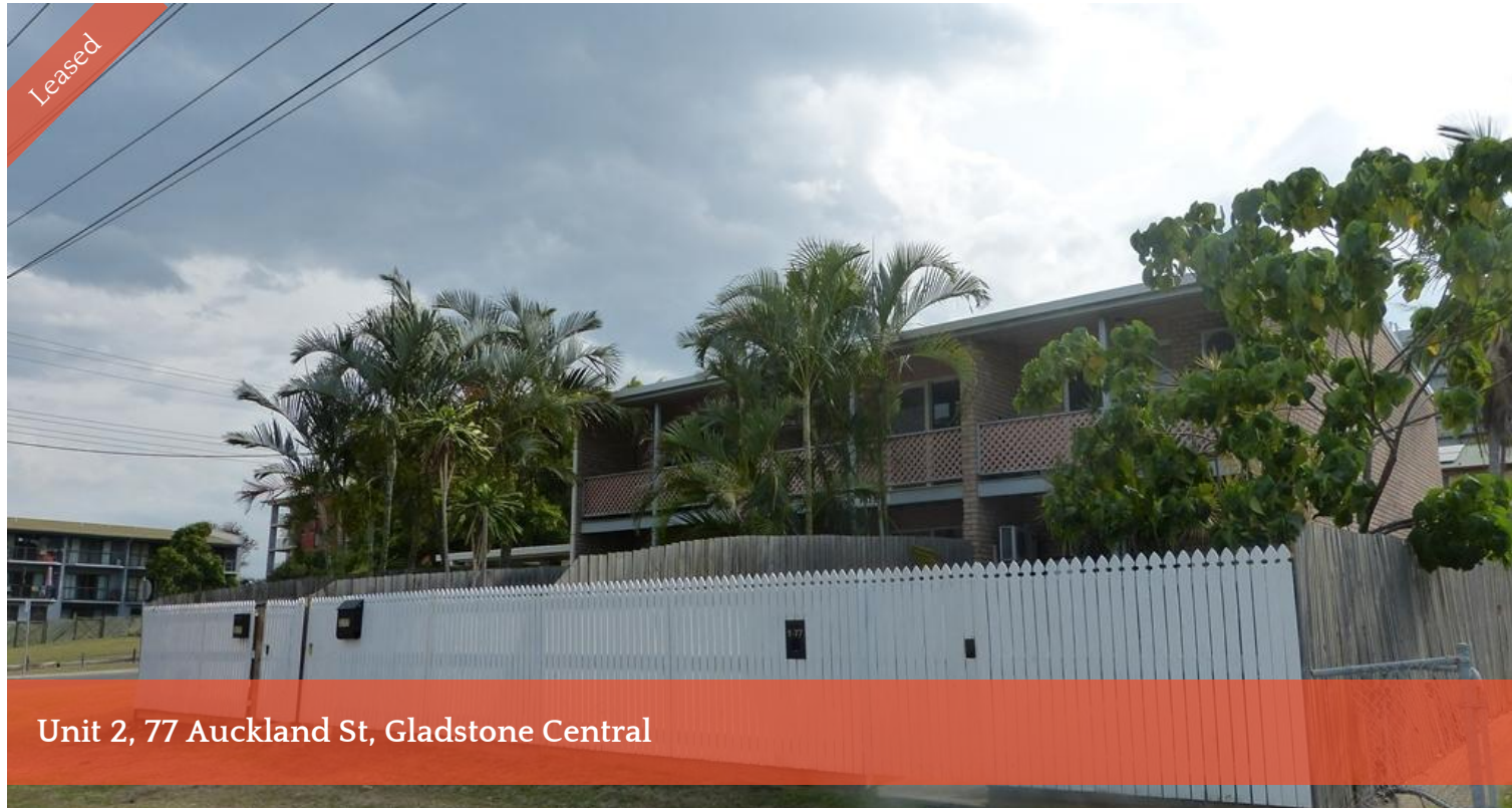
Unit 2, 77 Auckland St, Gladstone Central