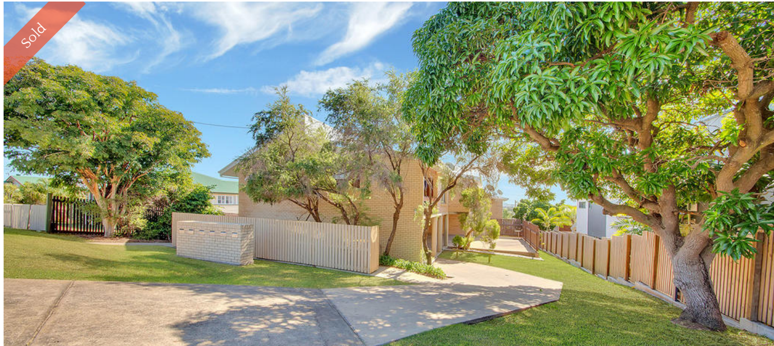
Unit 1, 2 Fowler St, West Gladstone